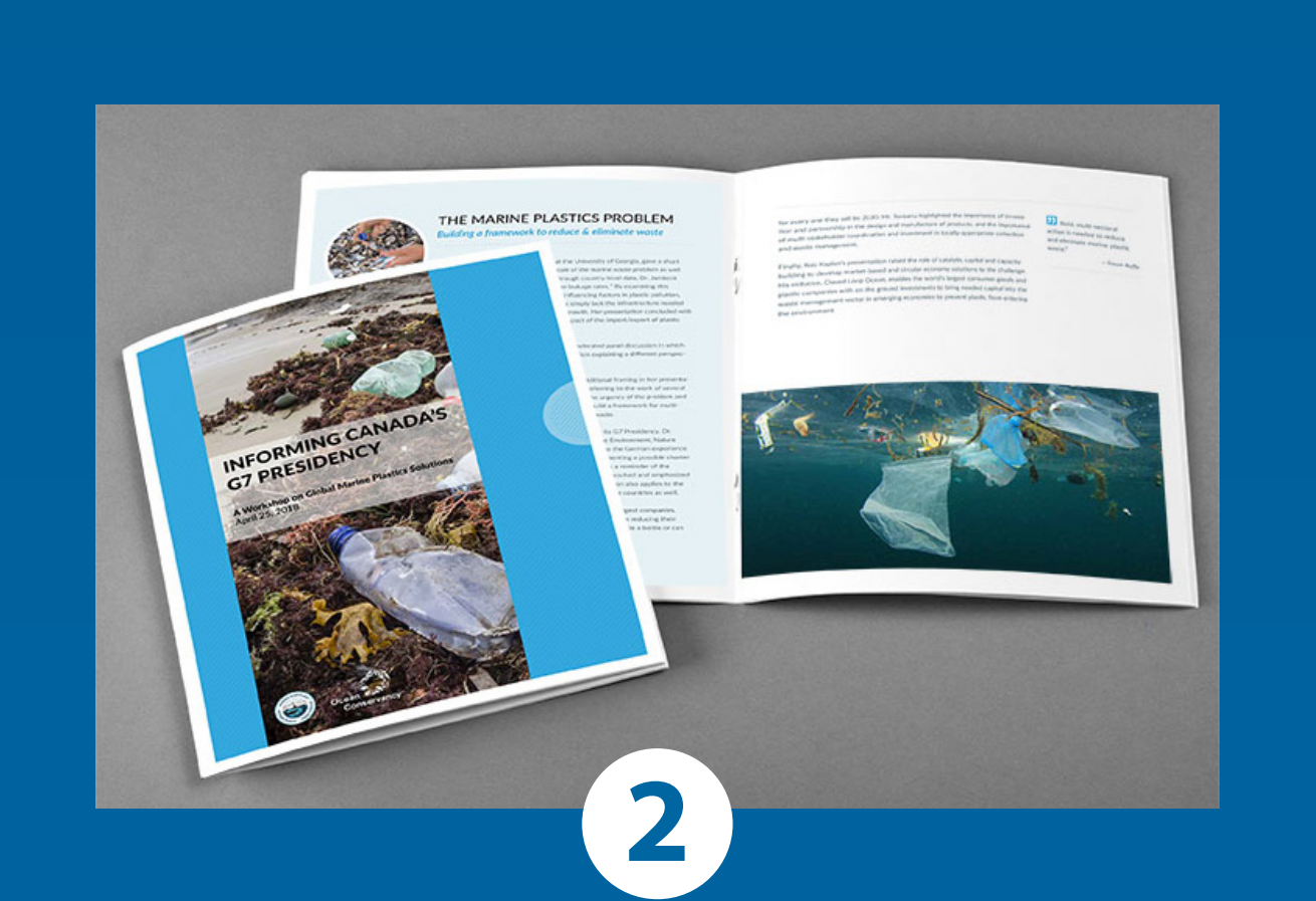
Recommends actions offered to Canada and the G7 ministers to support their ambitious goals for reducing marine plastics.