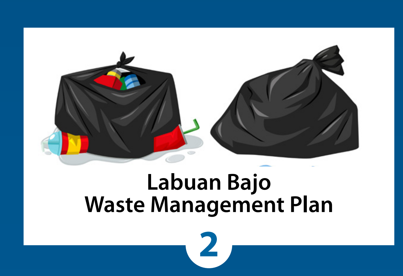
Identifies available vs necessary budget to implement a waste management strategy and mechanisms to bridge the gap