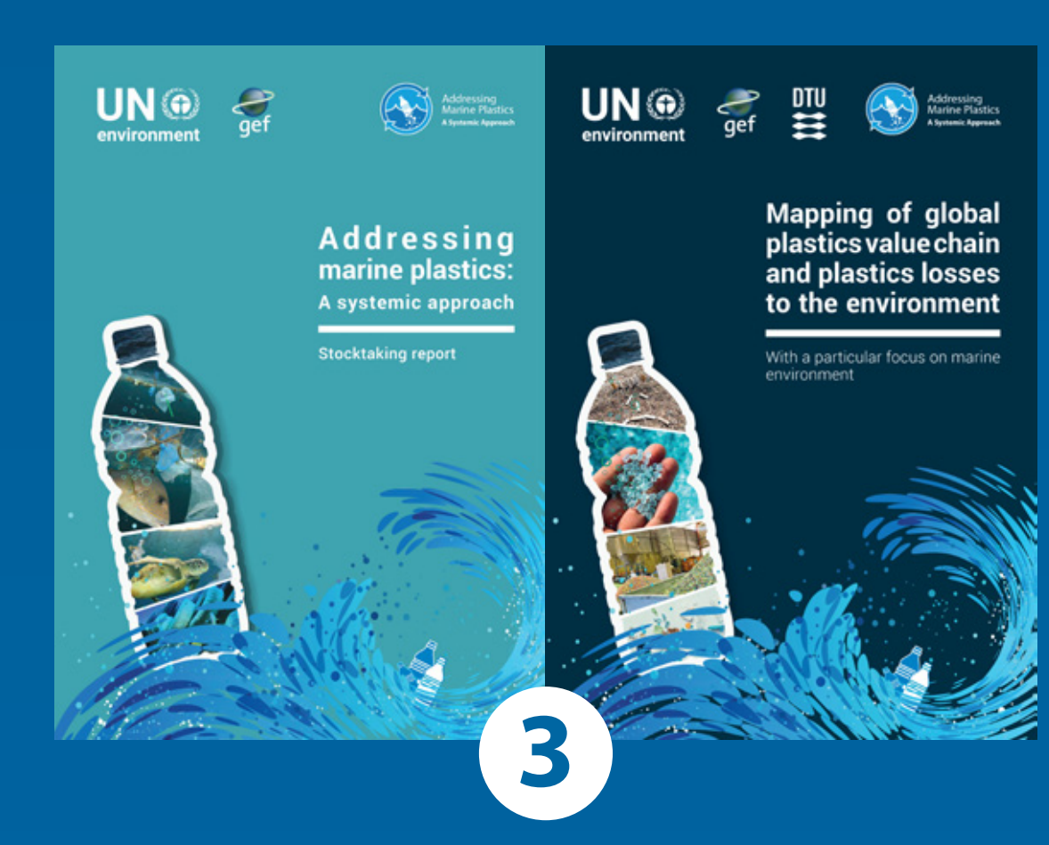
Stock-take existing knowledge & actions, and map plastic leakages to identify hotspots along global value chain.