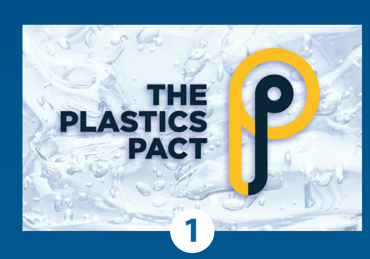
Unites local stakeholders to create systems where plastics remain in the economy