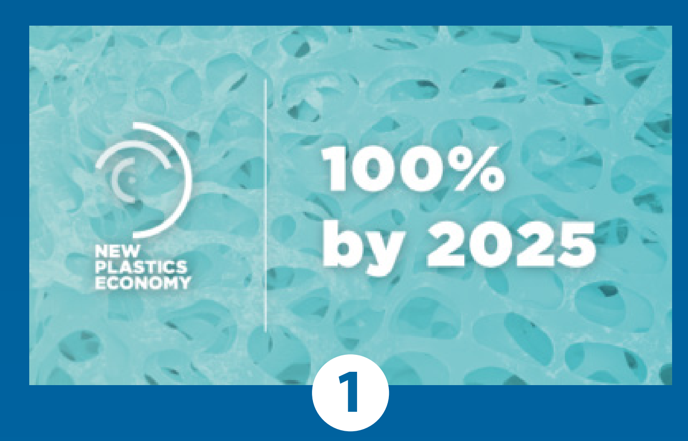
Companies and governments to commit to have 100% reusable, recyclable or compostable plastic packaging by 2025.