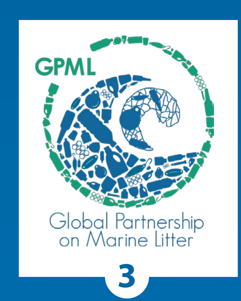
Network via the UN Environment Global Partnership on Marine Litter & UN Regional Seas Programme on marine litter issues.