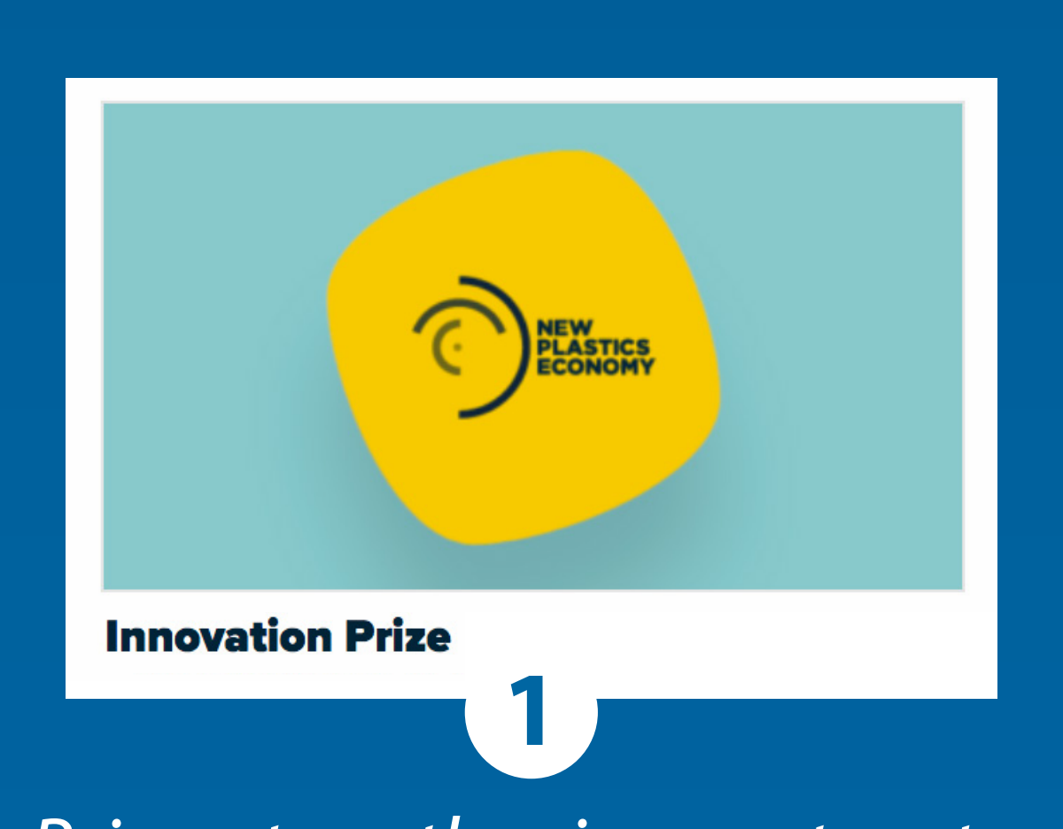
Brings together innovators to develop systemic solutions that prevent plastic from becoming waste in the first place.