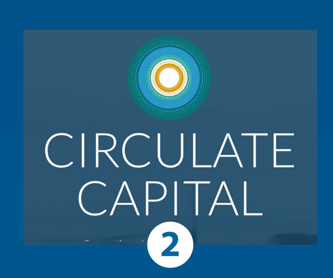
Finances local waste management solutions through an independent investment firm