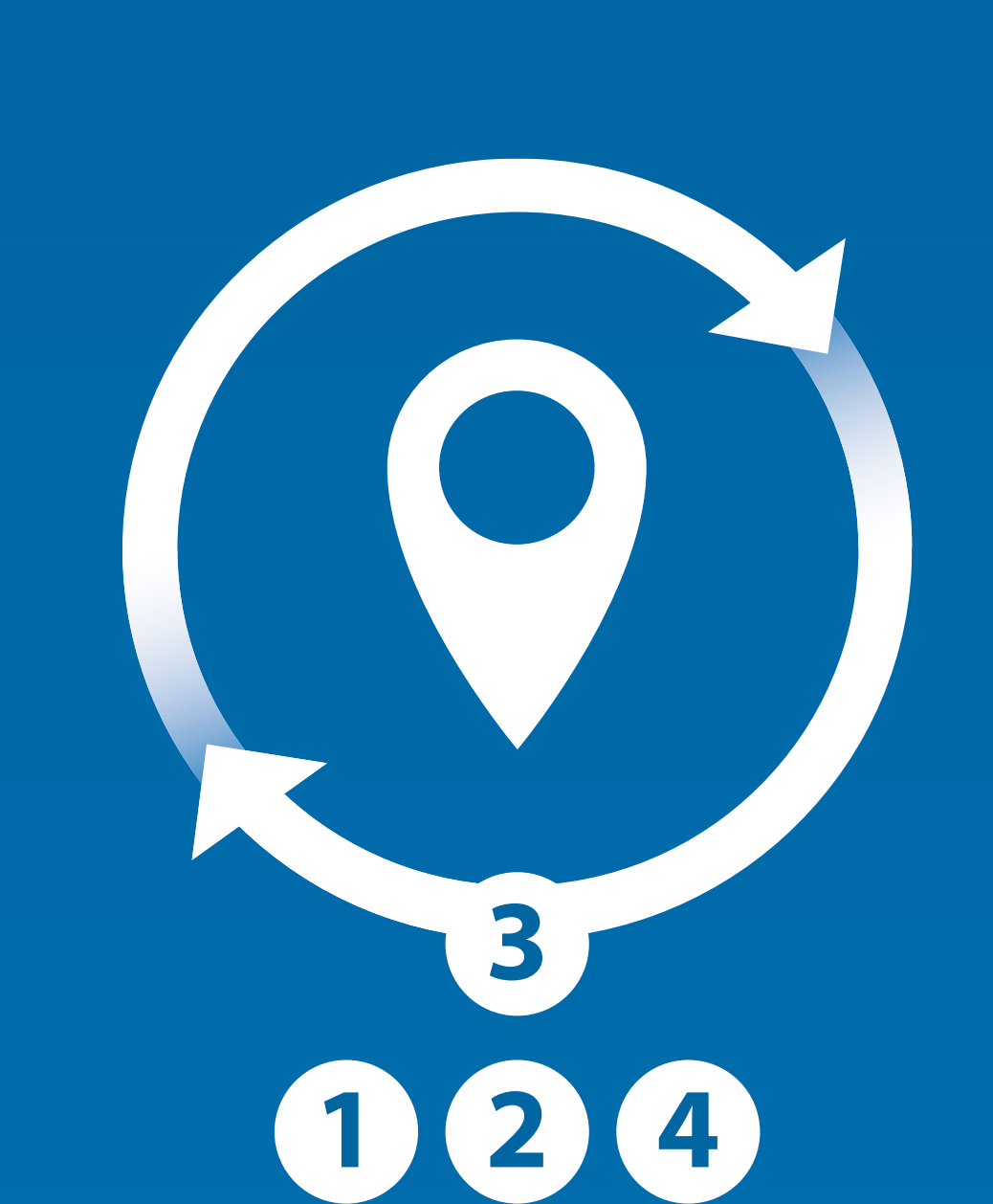
Formulate a strategic roadmap that enables a transition to a circular plastics economy.